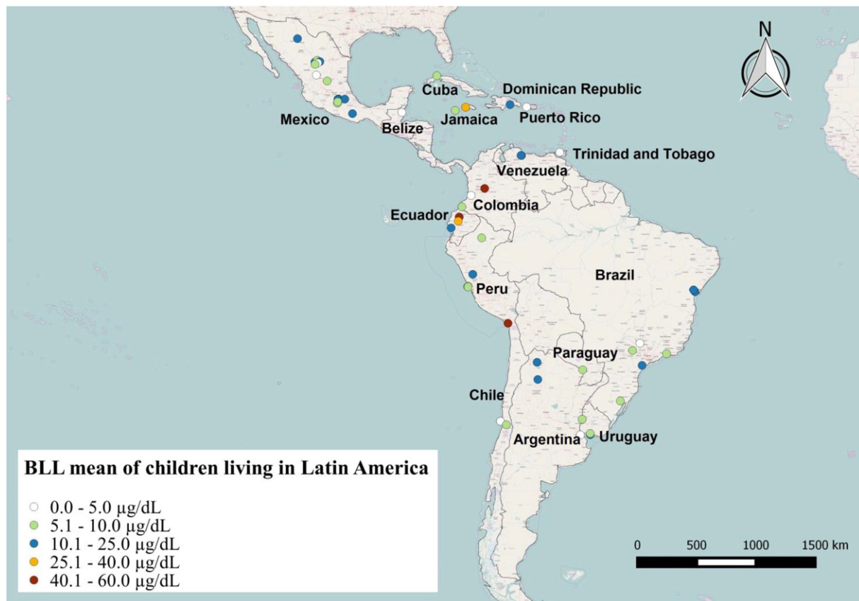
Fig. 2. Intervals of BLLs means or medians of children living in the LAC region. Lator et al. (2001) is not included in the map due to the non-reported BLL mean or median for the whole studied population.

and October 2006 (Disalvo et al., 2009). The geometric mean of the BLLs for that population was 4.26 µg/dL (95% CI 3.60–5.03). Prevalence of BLL \geq 10 \mu\text{g/dL} was 10.8%. One more study verified BLLs of populations with high risk of lead contamination. In Abra Pampa, Jujuy, a smelter worked until the end of the 1980's, and the waste has not been removed from the place. Children ( n = 25 ) aged 5 to 16 years had venous blood collected in 2004, and the mean BLL was 12.7 µg/dL, with 40% of the children presenting BLLs higher than 10 µg/dL (Barberis et al., 2006). Between 1991 and 1995, children residing in Tucumán, Argentina, were exposed to the environmental contamination of a lead smelter near their homes. Biological monitoring of 133 children aged 5 to 16 years reported that 98.5% had high BLLs, with a mean of 22.9 µg/dL (Riera et al., 2006).